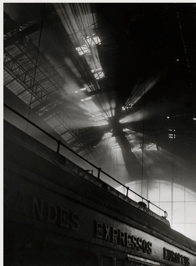
Filtered Light , by Martí Gasull i Coral, from the late 1940s

The Barcelona depicted in his photographs no longer exists. In Filtered Light , we see sunlight seem to burst in beams from different centers, filtered through the vaulted ceiling and skylights of France Station, in a backlighting effect where the dark element is a train carriage. It's a Portuguese express, as can be read in the bold, embossed lettering. In another image, the urban night appears silent, in the form of the stillness of parked cars and absence: there are no human figures, only the memory of movement, traces of light drawn