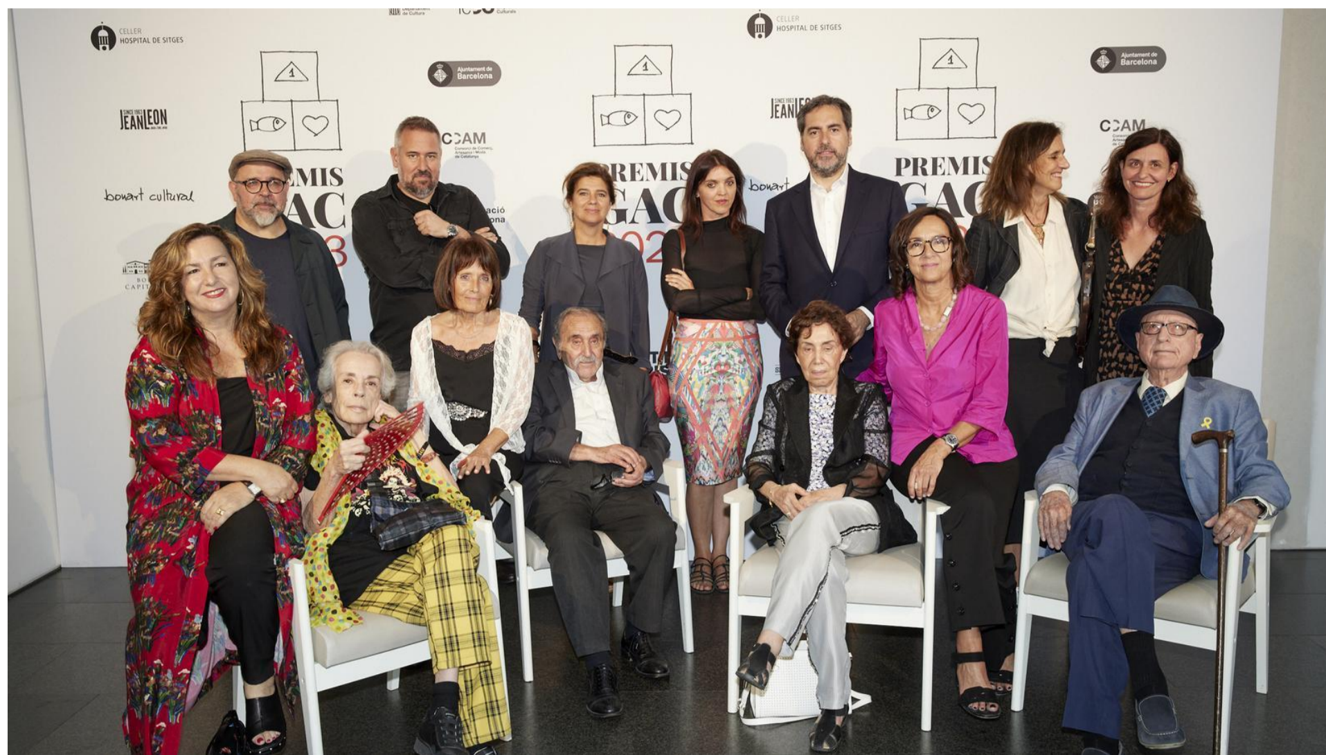
Family photo of the winners of the GAC Awards 2023