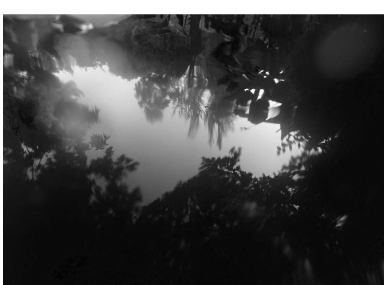
Amparo Fernández. Water-air 4. 2019. Digital printing. Edition of 5 copies.

In Homer's Odyssey is where the lotophagous are first mentioned, during Ulysses' journey to Ithaca. A strong storm diverted the ship to an island near North Africa where its inhabitants received them very kindly and offered to eat the lotus fruit as a welcome sign. The effect of their consumption made them forget to return to the ship until Ulysses managed to rescue the men and return them. Throughout this story, Homer appeals to the symbolism of the lotus flower to describe a human desire: the possibility of erasing the past and start again.