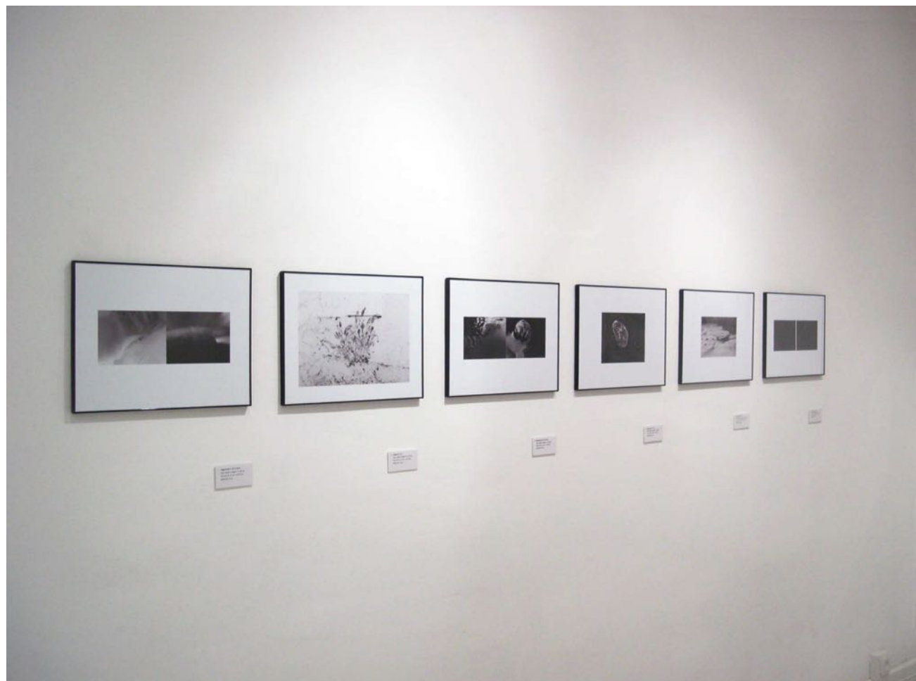
View of the exhibition Lotus flower by Amparo Fernández. Courtesy El quadern robot

At a time like the present in which silence, pause and introspection must be perceived as spaces for meditation, questioning and deepening, Amparo Fernández offers us an opportunity to delve into a photographic exercise in which the the passage of time becomes a personal, unique and unrepeatable practice and learning. A strong symbolic charge, which establishes a spiritual parallel with human life.