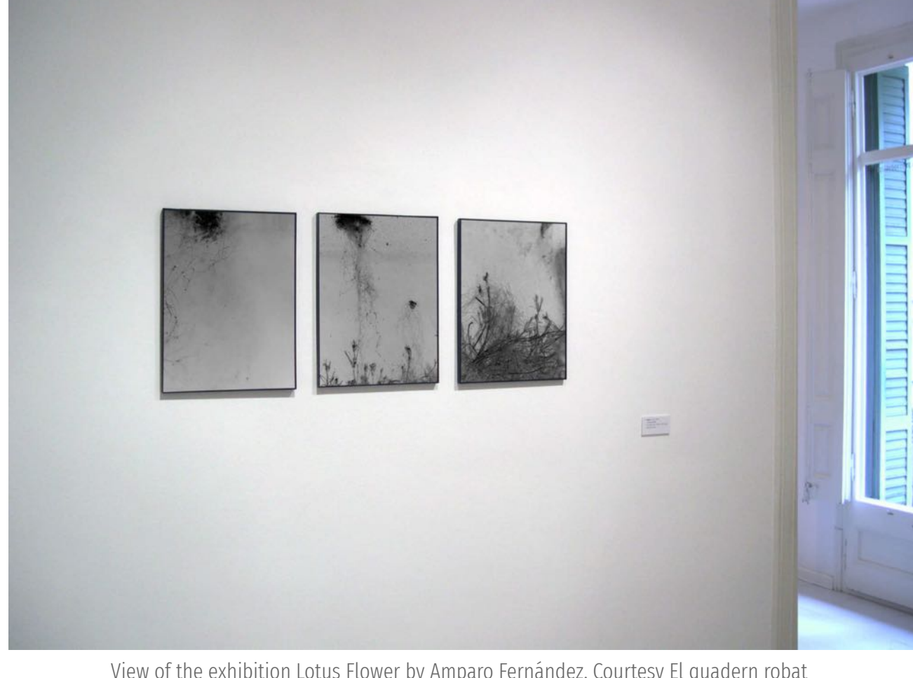
View of the exhibition Lotus Flower by Amparo Fernández.

The lotus flower has the ability to survive in harsh environments, in dark and swampy areas and its rhizomatous roots manage to make their way through the mud to reach the surface. The lotus is characterized by its large bluish green leaves and beautiful flowers that grow solitary at the end of long stems. To sprout it needs light and a deep habitation in which its roots can develop. White, pink, blue, yellow or bicolor, its flowers are also of considerable size and remain tall on high strands. Despite the hostile environment in which he rules, he flourishes in search of clarity and therefore has a close relationship with spiritual elevation and purity. The lotus flower is considered a sacred plant in China and India, so it has been attributed many meanings and symbolisms. It refers to the triumph of the spirit over the senses, means wisdom and knowledge, and is related to the perfection of the soul and mind, a state of total purity and immaculate nature. Hence, it is often associated with the complex life processes that human beings face.