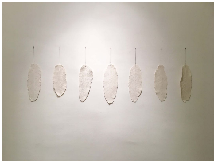
Set plomes , 2020, porcelain, variable measures

and spatial proximity, but separated by the years. Two Walks is a vanitas in motion: time passes inexorably for all living beings. Life is fragile and brief, our transit through the world and through life is ephemeral, but if we go beyond the concrete, we realize that it is eternal, because everything begins and ends over and over again, and so on until eternity. The works that we present in the exhibition The Flight , also refer us to the idea of vestige. The feathers of the installation Seven feathers become traces of life and passage through the world, witnesses of mutation and change. As are the white ceramics of the Trophies series, made during the confinement of spring 2020 and which are also the protagonists of a photographic series. These ceramic pieces inevitably make us think of the work by Edmund de Waal and especially of the book The white road, journey into an obsession , in which he describes the different origins of porcelain, the material to which he has dedicated his entire life. Morrison's ceramics refer to both the fragility of human life and the idea of contingency.