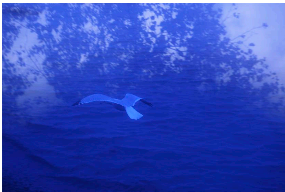
Vol , 2019, digital print, 160 x 200 cm (62.99 x 78.74 in) single copy