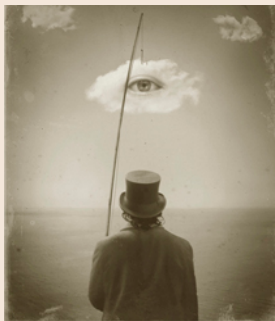
'Only one eye', by Jolonch.