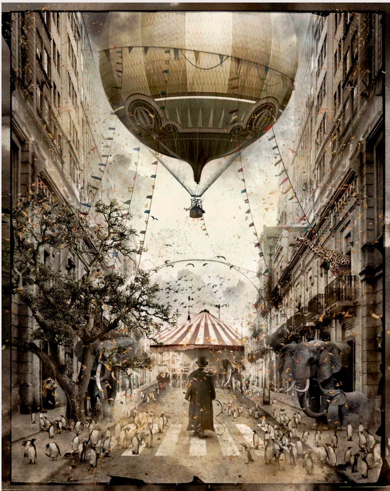
'The track director'