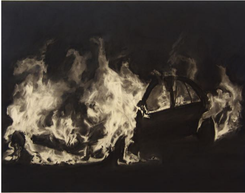
Revelacions 11 , 2017, graphite powder on paper, 58 x 72,5 cm (22 13 / 16 x 28 9 / 16 in)