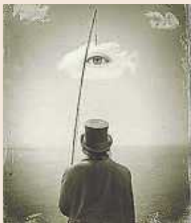
'Only one eye', by Jolonch.