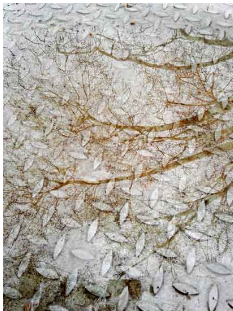
Steel trees, 2018, digital print on aluminum, 40 x 30 cm (15.75 x 11.81 in) ed. 5 ex.