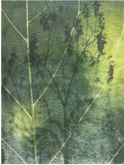
Fulla 2, 2019, ( Leaf 2 ) single copy. transfer on paper, 29 x 22,5 cm (11.42 x 8.86 in)