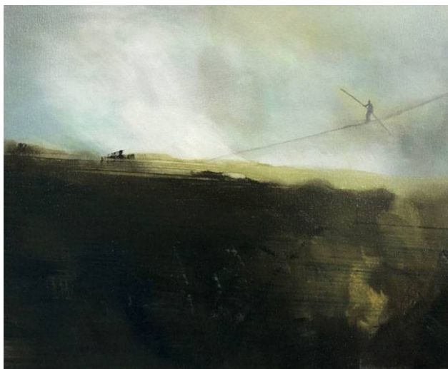
Retornant a l'horitzó, 2021 ( Returning to the horizon ) oil on canvas 30 x 45 cm (11.8 x 17.7 in)