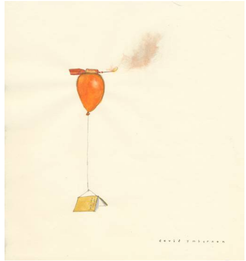
Llibre d'acció Carles Hac Mor, 2018 ( Action book Carles Hac Mor ) watercolor, 21 x 23 cm (9.05 x 8.27 in)

The exhibition will be open until October 30, 2021. For more information, contact the gallery: info@elquadernrobot.com – 93 368 36 72 el quadern robot, còrsega, 267, principal 2 b, 08008 barcelona, elquadernrobot.com