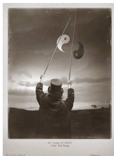
Mr. Jones XXIII. Yin Yang, 2017 digital print, 18 x 13 cm, ed. 25 ex (7,09 x 5,12 in)