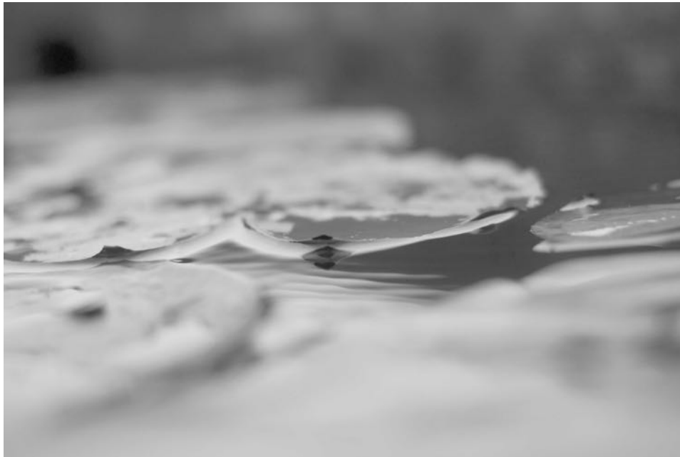
Aigua-aire 3 , 2019, 30 x 40 cm (11.81 x 15.75 in) ed. of 10 ex.