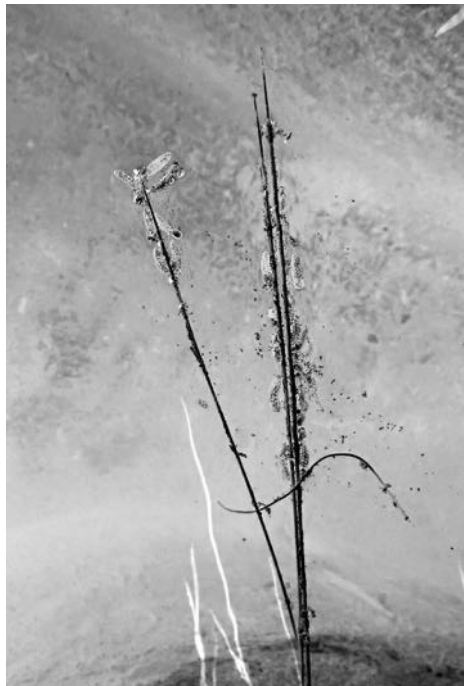
Aigua 7 , 2019, 40 x 30 cm (15.75 x 11.21 in) ed. of 10 ex.

Amparo Fernández carried out a parallel personal investigation, which consisted of recording the evolution of the growth of the lotus flower, since its birth in the mud from the bottom of a pond, until it blooms above the water. All the sequences of this process carry in themselves a strong