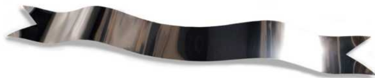
No dir res, 2006, polished stainless steel, 20 x 188,5 x 12 cm (7,87 x 74,21 x 4,72 in)