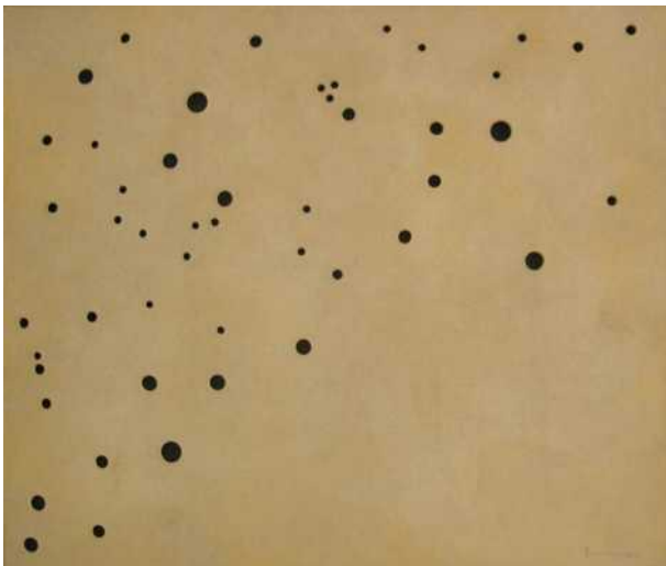
Untitled , 2012, mixed media on wood, 42,5 x 50,5 cm (16,73 x 19,88 in)