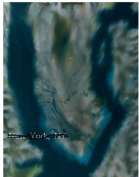
New York, 12-3-15, 2012, oil on canvas, 116 x 89 cm (45.87 x 35.04 in)