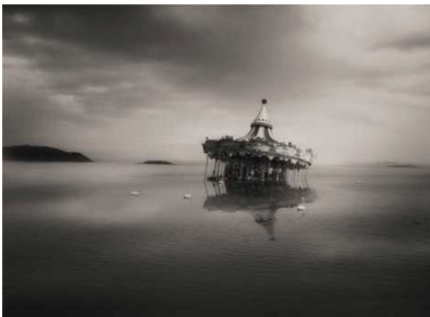
Carrusel, 2019, digital print, 60 x 80 cm (23,62 x 31,50 in) ed, 5 ex.