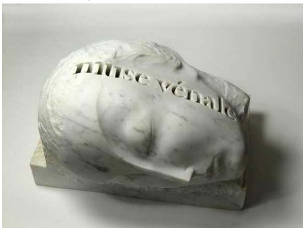
Muse vénale, 2015, Carrara marble, 30 x 43 x 34 cm (11,81 x 16,93 x 13,38 in)