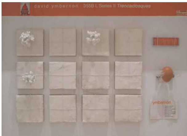
355B L Series II Trencaclosques , 2006, mixed media, 63 x 83 x 15 cm (24,8 x 34,64 x 5,9 in)