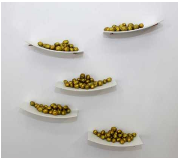
Massa soroll, 2019, mixed media, 80 x 80 x 13 cm (31,5 x 31,5 x 5,12 in)