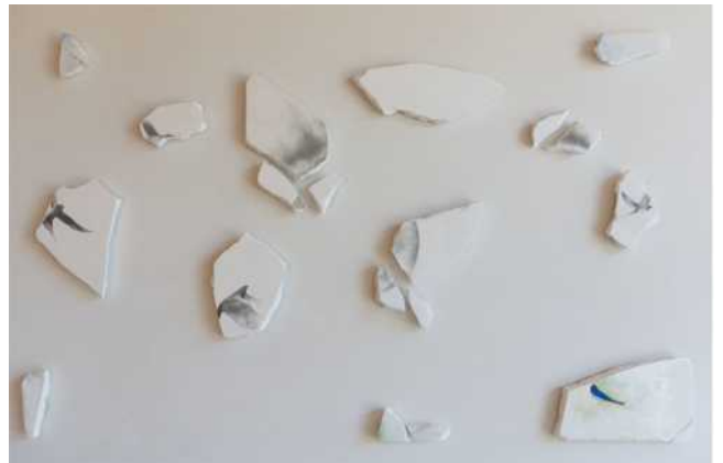
Viure la bellesa , 2019, mixed media on marble, 85 x 137 x 2 cm (33,46 x 53,94 x 0,79 in)