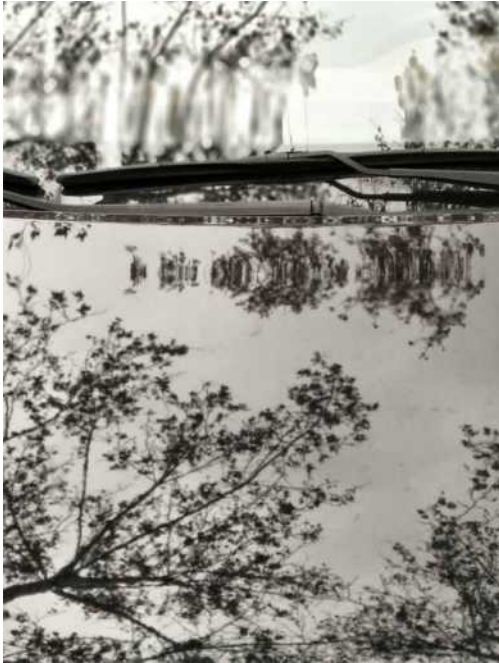
Metamorfòsia I , 2018, digital print, 51,41 x 38,81 cm (20,24 x 15,28 in) ed. 5 ex.