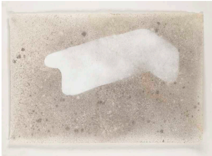
Protòlit, 2018, Chinese ink on ukiyo paper, 65 x 90 cm (25,59 x 35,43 in)

The works that we present now are a free interpretation of monoliths, mostly natural, that even today we can find. The lightness of the forms represented in the works of the series