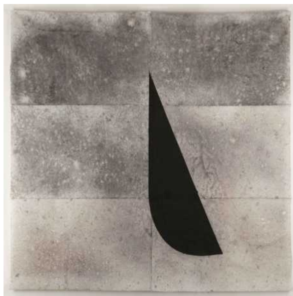
Dois Irmaus, 2018, Chinese ink on ukiyo paper, 200 x 200 cm, (78,74 x 78,74 in)

The word "monolith" refers to both natural geological formations and human constructions that are characterized by being a block of large stone. Already in prehistory, the veneration of these great natural stones, loaded with magnetic force due to their volcanic composition, led men to create new ones. His belief was that these monoliths put the telluric forces in contact with the energy of the