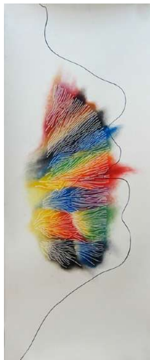
Air de Paris 2013. 41.3 x 17.7 in