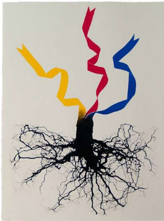
Sèrie arrels - Arbre 2012, charcoal and pastel on paper, 29,9 x 22 in