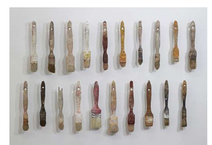
Pinzells 2016, old brushes 21 x 113 x 1 cm