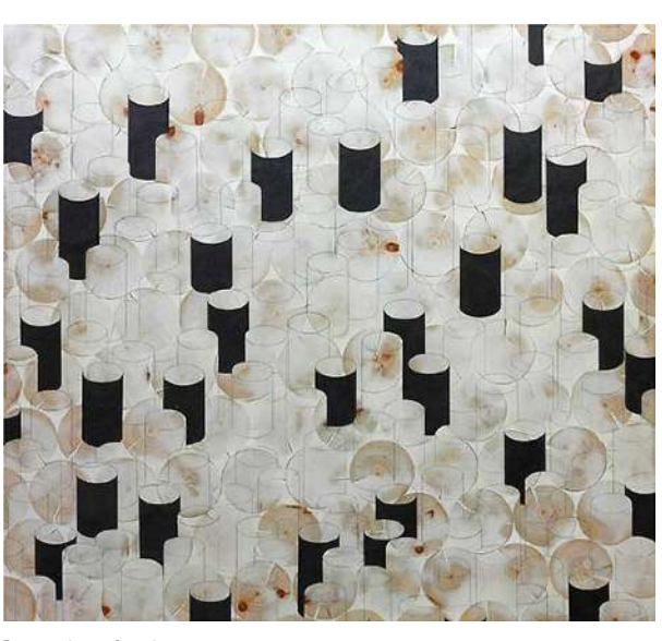
Gots de núvol 2009, mixed media on wood 120 x 110 x 5 cm

comes from the observation of his environement, which encourages him to explore different ways to communicate his impressions in the richest and most essential way. His works, always contain a participatory and didactic component, since the spectators feel invited to