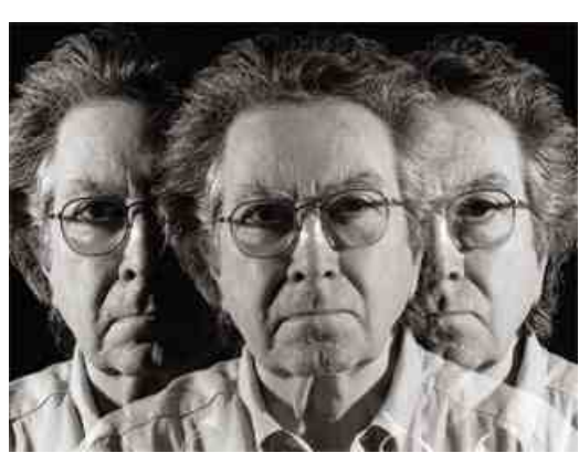
Antoni Tàpies, Barcelona 1995, 30 x 40 cm

photography, and in the laboratory, where he learned all about photographic developing, slides (Ektachrome),