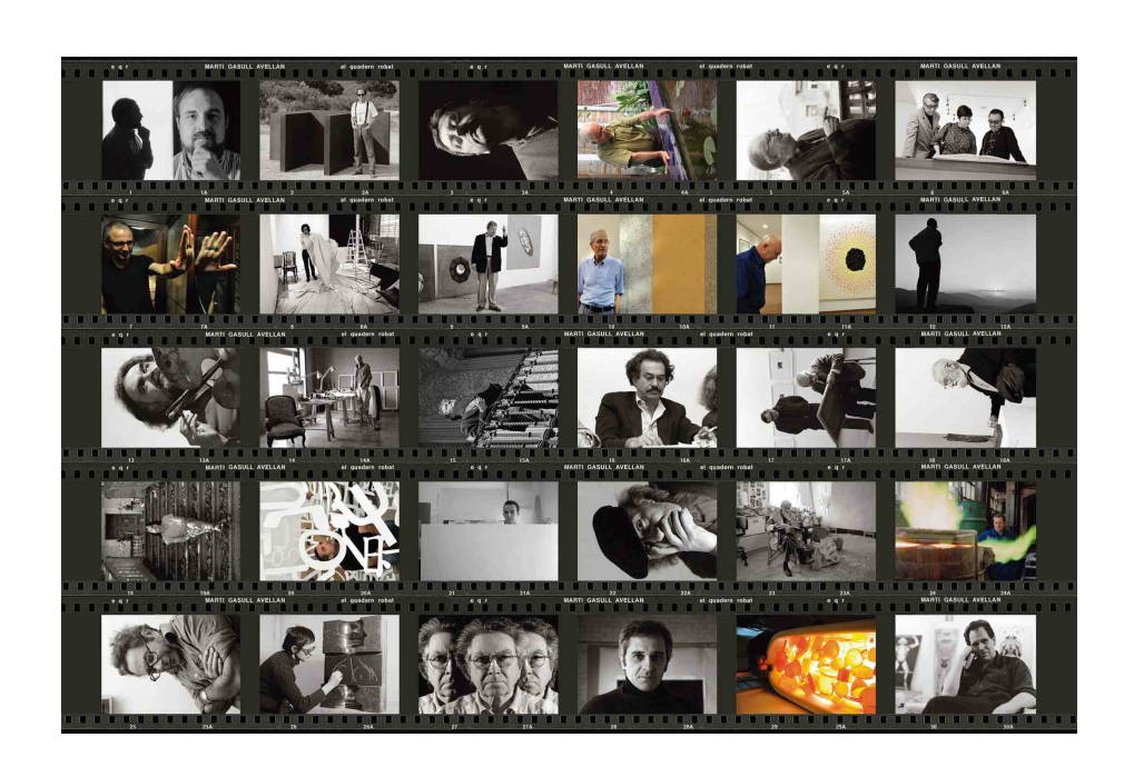
October 25 , 2016 - January 30 , 2017

The exhibition consists of 29 portraits and a self-portrait made between 1965 and 2016. A large part of the photos belong to the group of more than 4,000 negatives that Martí Gasull left in MACBA on consigment. Bernat Gasull i Roig in the foreword to the catalog of the exhibition that took place between May and September 2016 at the Museum of Montserrat wrote: (...)