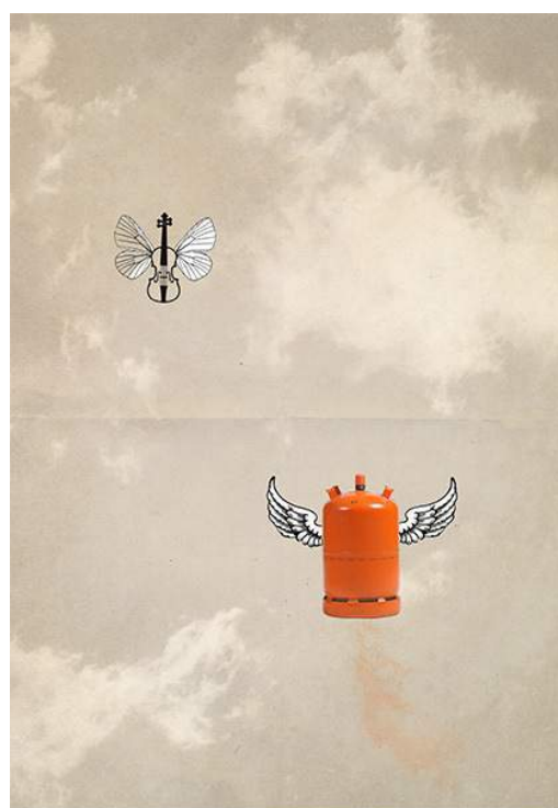
"s/t" 2014, digital giclée, 41,78 x 29 cm, ed. 50