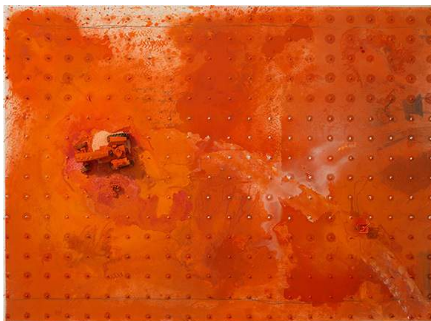
"Tractor carbassa" 2012-2014, mixed media on wood, 157 x 206 x 18 cm (61,8 x 81.1 x 7,09 in)